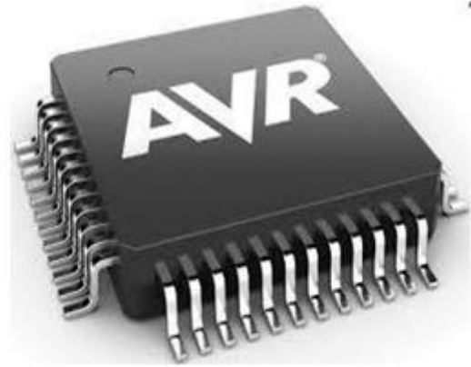
Figure: AVR Microcontroller

The first AVR line was start from AT90S8515. It have 40 pin DIP packages like as an 8051 microcontroller. It also has two buses one is data bus and another is addressed bus. The polarity of AVR microcontroller is opposite of 8051 microcontroller. In AVR microcontroller has active low RESET but in 8051 microcontroller has active high RESET. And all another's pins are same. The architecture of AVR 8 bit microcontroller was introduced in 1997. AVR Microcontrollers are classified into three types,