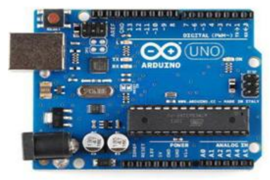
Figure: Arduino Microcontroller

Arduino is a microcontroller device. It is an open source electronics platform. It is very easy to use for both software and hardware. The arduino UNO board is totally based on ATmega 328 there are total 14 digital input output pin in which 6 pin can be used as PWM output. It contain 16 MHz ceramic resonator, an ICSP Header, a USB connection, 6 analog input, power jack, also a reset button. These all are supporters of microcontroller. To start the arduino UNO it connects to the computer by using USB cable or AC to DC adaptor. From all other board Arduino UNO varies and they will not use the FTDI USB-to-serial driver chip in them. There are various types of Arduino but most of them were third party compatible version. The official version of arduino UNO is arduino UNO R3 and Arduino Nano V3.