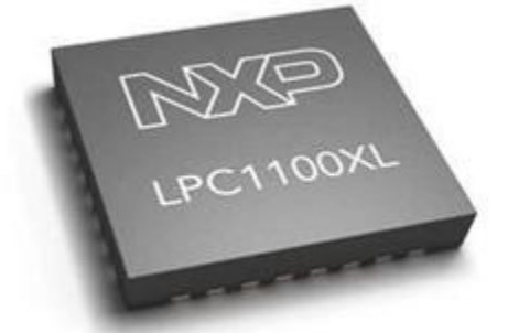
Figure: ARM Microcontroller

ARM Microcontrollers are extremely used in power saving and operate in very low power consumption. ARM includes integer arithmetic operations for sub, add and multiply; some versions of the architecture also support divide operations. ARM Microcontrollers Widely used in modern handset for mobile communications. These are also used in various other embedded system likes iPod, hand held gaming unit disk driver and so on. 8051, PIC need multiple clock cycles per instruction. AVR and ARM both execute most instructions in a single clock cycle.