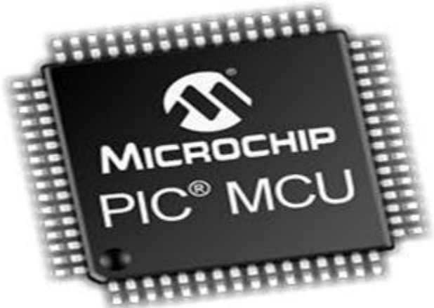
Figure: PIC Microcontroller

Pic microcontroller is also a family of microcontroller. PIC stands for peripheral interface controller it is specialized as microchip technology in Chandlers, Arizo. The peripheral interface controller was developed by microchip in the year 1993 but now a days pic microchip are rarely used the PIC microcontroller chip is designed very compactly so it is very small in size and easy to used it operates in embedded system it is also used in robot, home appliances, medical devices, etc. PIC microcontroller works very fast and the program executing are very easy as compare to another microcontroller. This microcontroller has some special specification that is it includes wide availability ease of programming, serial programing capacity. In PIC Microcontroller CPU includes ALU, Memory unit and accumulator. ALU is used for arithmetic and logical operations.